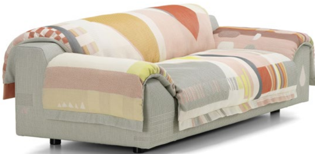
Vlinder Sofa, light reds

Tailored Fabric comes in a choice of 4 colour schemes by Hella Jongerius.