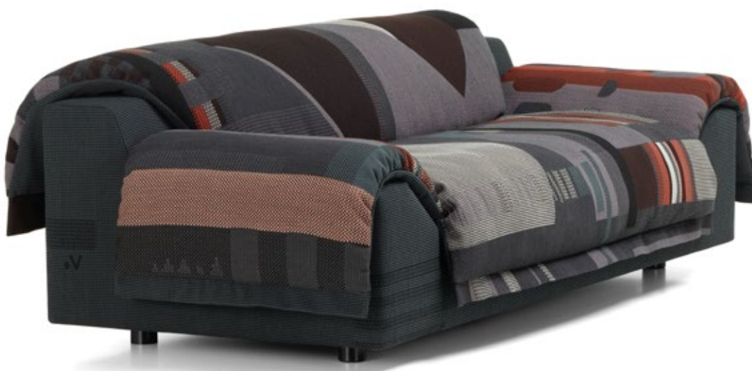
Vlinder Sofa, dark reds