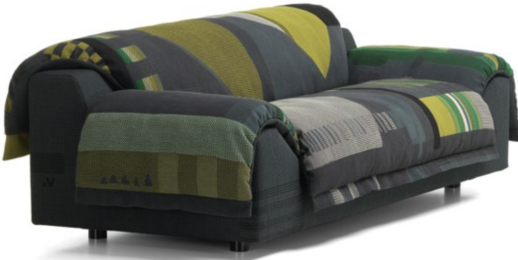
Vlinder Sofa, dark greens