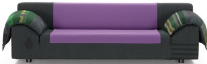
Sofa body covered in dark-toned fabric for covers in dark greens or dark reds

The body of the sofa is covered with a fabric that is colour coordinated with the cover. The non-visible inner surfaces of the seat and backrest are covered with a two-way stretch fabric, which enhances the snugness of the upholstery, thanks to a high degree of elasticity.