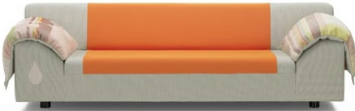
Sofa body covered in light-toned fabric for covers in light greens or light reds

The base is supported by steel legs with felt glides.