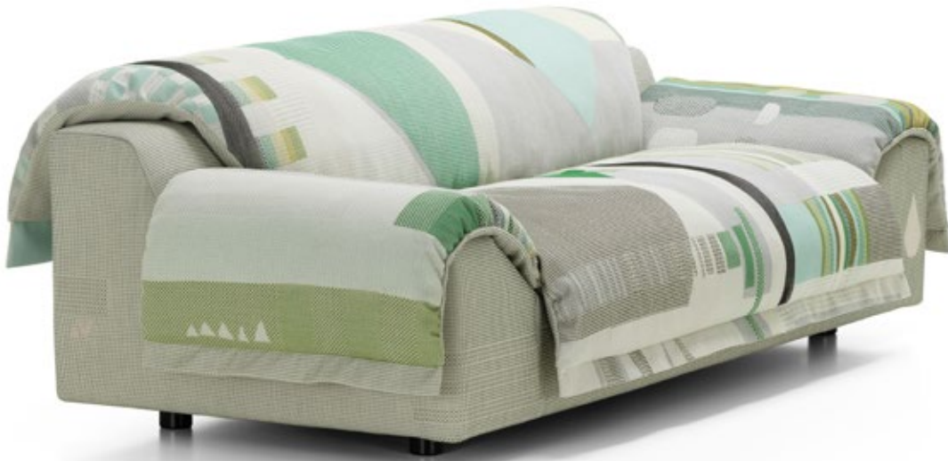
Vlinder Sofa, light greens